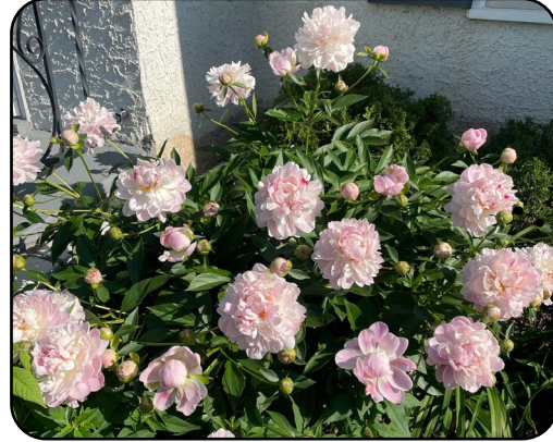
To the right of the front door are light pink peonies. They usually bloom in early June.