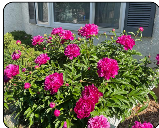
On the east side of the front of the house are hot pink peonies.