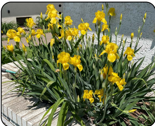
Also along the front left are daylilies, colorful tulips (first to bloom each spring) and wild geraniums, and we add annuals.